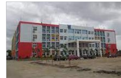
Narayana IIT Academy

Feel connected to life, both personal and professional, with a home that is located in the best of neighborhoods. Swasthi by Samracana Projects is perfectly placed at Kardanor, near Kollur ORR exit, between exits 2 & 3, inviting you to experience a unique blend of comfort and convenience.