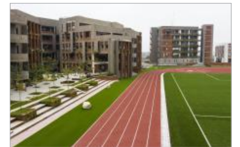
The Gaudium School