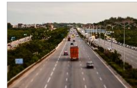
Outer Ring Road