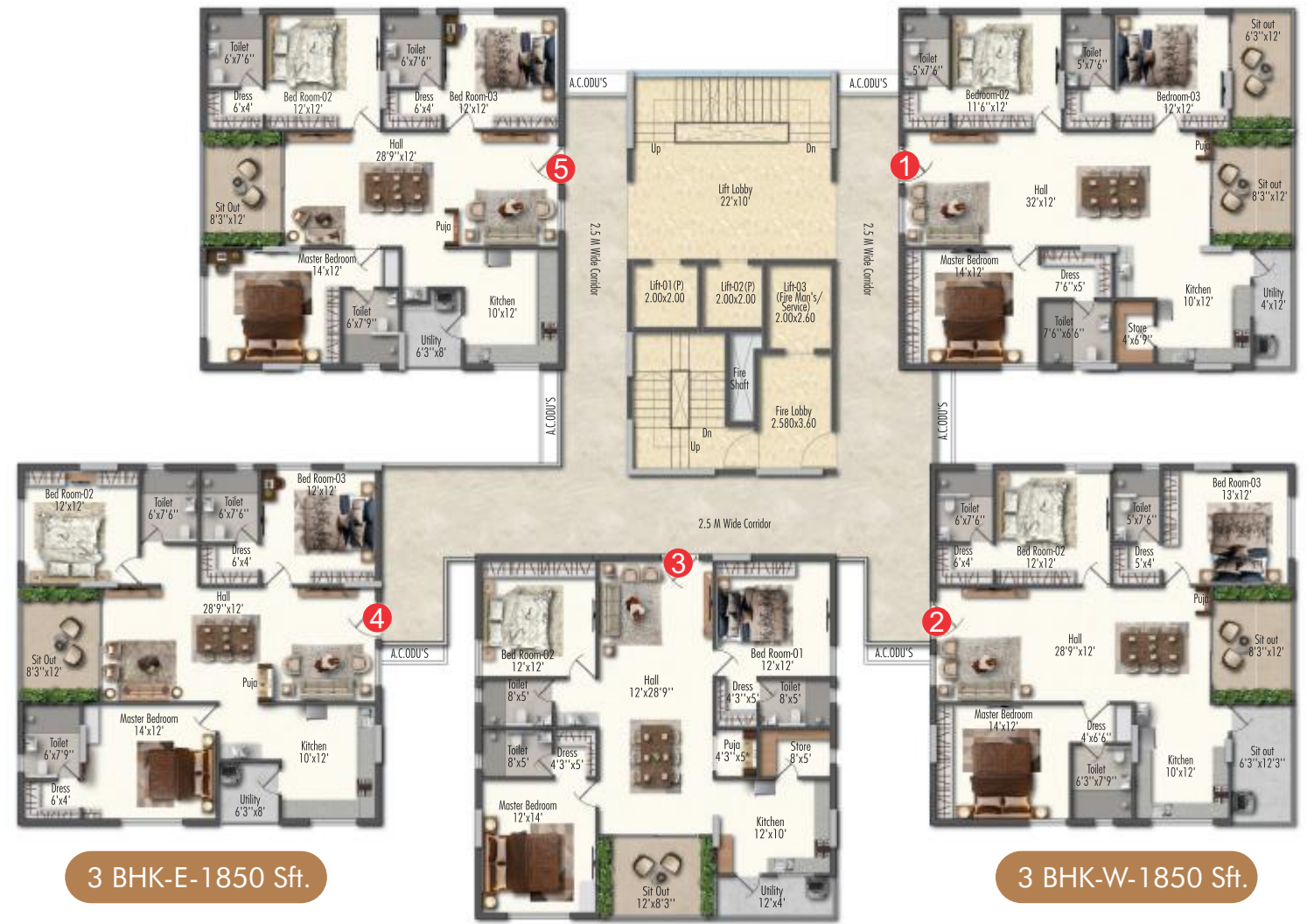
3 BHK-E-1850 Sft.